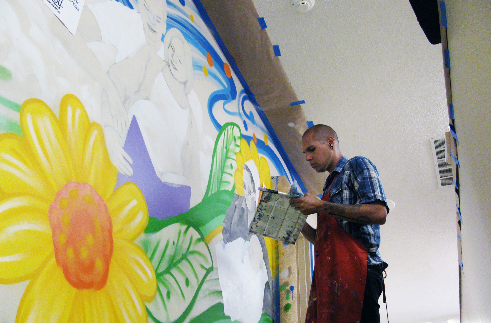
WENDY SKELLENGER/HUTCHINSON COMMUNITY FOUNDATION